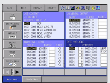
MULTIPLE WINDOW PENDANT DISPLAY