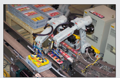
MULTIPLE ROBOT CONTROL